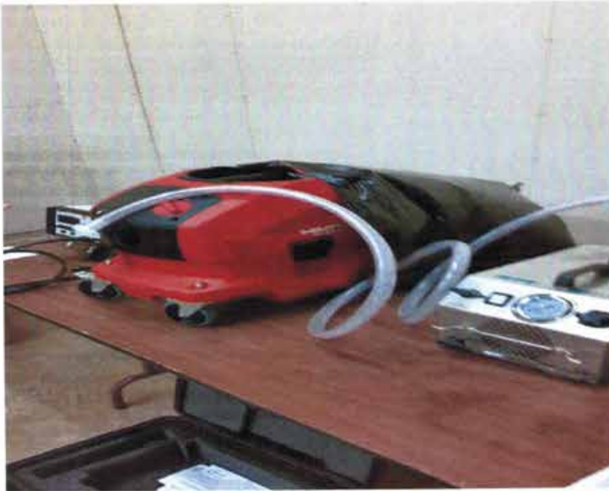
Test Setup showing Aerosol Generator on right HILTI VC20U Vacuum in middle with catch bag attached, and Aerosol Photometer on the left

No leakage greater than .005% was detected