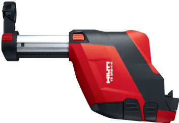
Dust removal system TE DRS 4-A