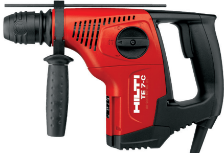
Rotary hammer TE 7 or TE 7-C