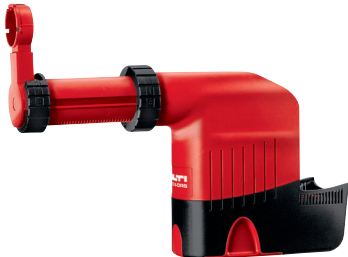
Dust removal system TE DRS-M