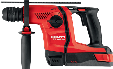
Rotary hammer TE 6-A 36