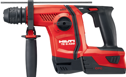
or Rotary hammer TE 6-A22