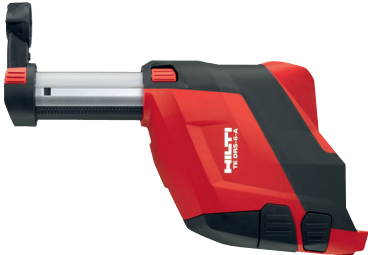
Dust removal system TE DRS 6-A