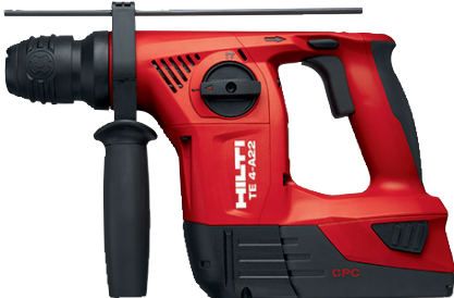
Rotary hammer TE 4-A 18 or TE 4-A 22