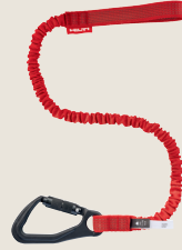
Tether 11.4kg (25lb) #2261971