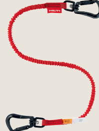
Tether 6.8kg (15lb) #2261970