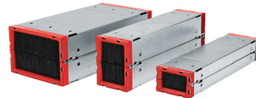
Single sleeve for ganging (S,M,L)